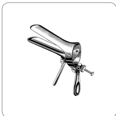
Speculum, Vaginal, Cusco, SS