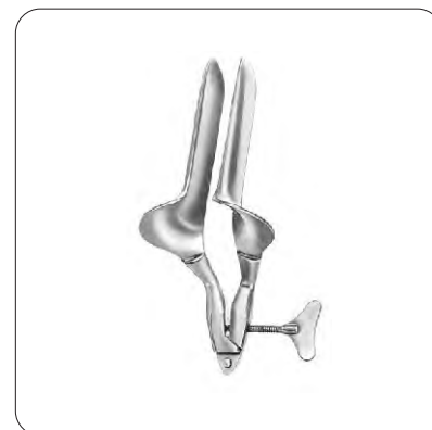
Speculum, Vaginal, Collin, SS