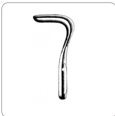
Speculum, Sims, SS