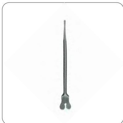
Groove Director, SS