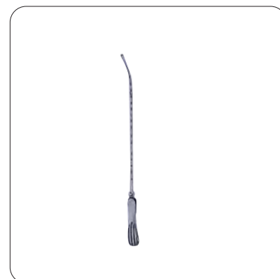
Marlin, Uterine Sound, SS