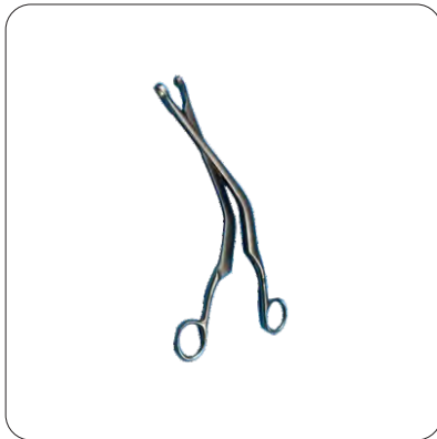
Forceps, J.L Faure Biopsy, SS