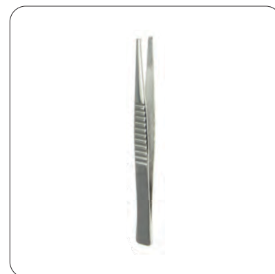
Forceps, Disecting Non Toothed, SS