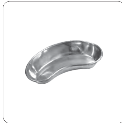
Kidney Dish, SS