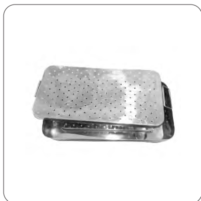
Sterilizing box, SS